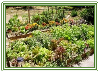
“Planting seeds for the future”