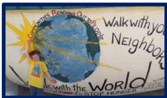
CROP HUNGER WALK ENDING HUNGER ONE STEP AT A TIME